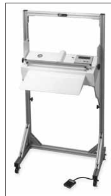
OPTIONAL ERGONOMIC MULTI-POSITION ACCU-SEAL STAND (SHOWN W/ MODEL 635-232)