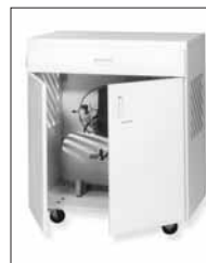
OPTIONAL PORTABLE ACCU-SEALER CART (SHOWN W/INDUSTRIAL COMPRESSOR)

The Accu-Seal Model 730 Validatable Sealer was designed, built, and tested to give years of reliable, trouble free service.