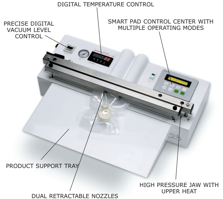
PICTURED: 635HP GAS-VACUUM SEALER