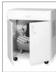
OPTIONAL PORTABLE ACCU-SEALER CART (SHOWN W/INDUSTRIAL COMPRESSOR)