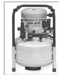
OPTIONAL ULTRA-QUIET LAB/OFFICE COMPRESSOR