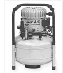
OPTIONAL ULTRA-QUIET LAB/OFFICE COMPRESSOR