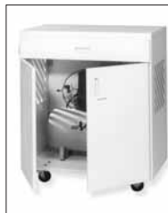
OPTIONAL PORTABLE ACCU-SEALER CART (SHOWN W/INDUSTRIAL COMPRESSOR)

The Accu-Seal Model 235 was designed, built, and tested to give years of reliable, trouble free service.