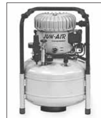
OPTIONAL ULTRA-QUIET LAB/OFFICE COMPRESSOR